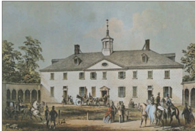
Painting of Mount Vernon as it appeared at the time of George Washington

'Posada' means lodging or shelter and refers to the story told in the Bible (The Christian Holy Book) of the journey of Mary and Joseph to Bethlehem where they sought lodging before Jesus was born. The Holy family finally ended up taking refuge in a stable where Mary gave birth to the Christ child. Today, each town has its own way of depicting this story through Las Posadas...It's a very humble ceremony. It's not a Hollywood production.