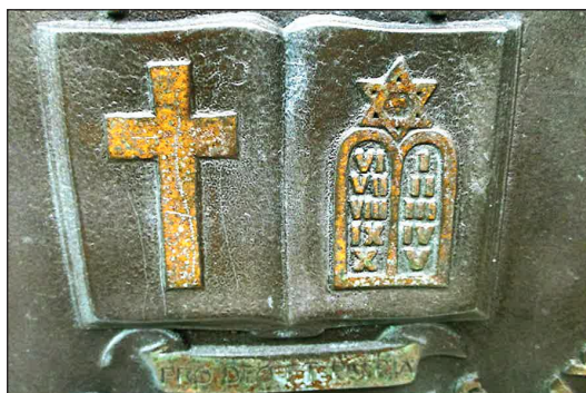
Close-up photograph of the Seal of the United States Army Chaplains, depicting its 1775 historic date; a dove, symbol of the holy Spirit; the Cross of Christ; a Star of David above the two Tables of the Ten Commandments with descriptive wording: "Pro Deo et Patria" (For God and Country) Chaplains United States Army.

"A government that roams the land, tearing down monuments with religious symbolism and scrubbing away any reference to the Divine will strike many as aggressively