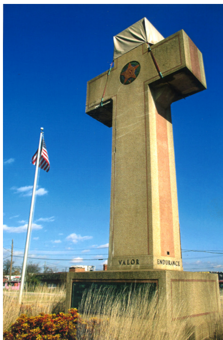
The Peace Cross, Bladensburg, Maryland. “Justices Allow 40-Foot Cross Built in 1925 to Remain on State Property.” Headline of New York Times, June 20, 2019 article.

Raisa writes: ‘The Kholkhos system has destroyed social injustice, wherein material blessings were placed at the disposal not of the producers of them but rather of a group of large-scale proprietors.’ Decrying Christianity as the ‘opiate of the masses,’ she points out that, in one village, ‘16.6 percent of Kolkhoz families headed by office workers – or the Kolkhoz intelligentsia – possessed icons. And among families headed by field-crop growers – or service personnel – 66.6 percent had icons.’ Raisa was so outraged by those signs