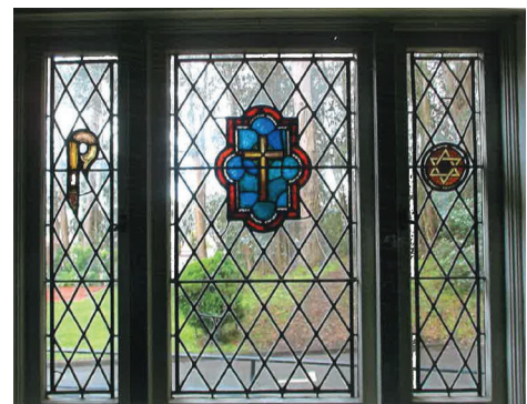
Stained-glass window in outer alcove of the Presidio Chapel, portraying a Star of David in the right lancet. Centrally located is the Cross of Christ – to its left is a Shepherd’s staff.