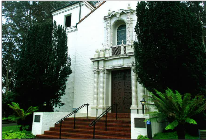
The Presidio Chapel , inaugurated in 1931, designated to Protestant Christian worship services.

said the New York artist and architect, 'Defense can mean protecting the planet.' The Army has until September 1995 to abandon the Presidio, but has indicated it will pull out by September, 1994."