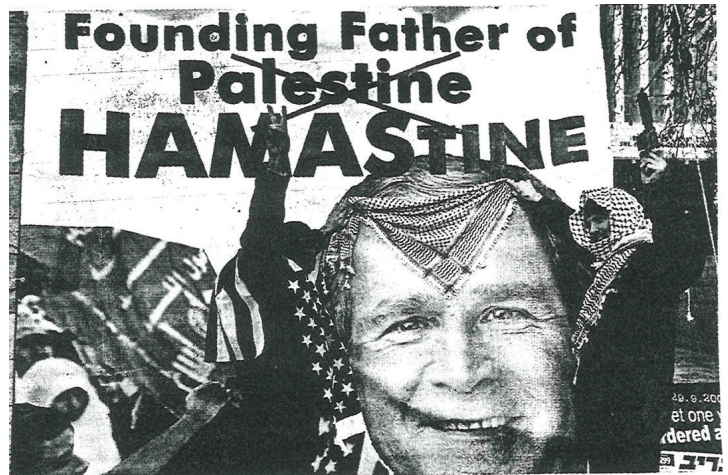
Israeli protestors wearing keffiyehs demonstrate against the visit of President George W. Bush after his arrival in Jerusalem on Wednesday, January 9, 2008.

Mr. President, Israel’s current predicament is part of the global jihad, which includes the Western democracies! These jihadist forces can be defeated and this can be accomplished by a strong and resolute America, acting in concert with other democracies including Israel. That should be your vision and your legacy. The only reason the jihadists are still held at bay in our own region is that Israel’s defense forces are still operating in Judea and Samaria. May God bless Israel and America.” Undersigned by: A former Chief of Staff to Prime Minister