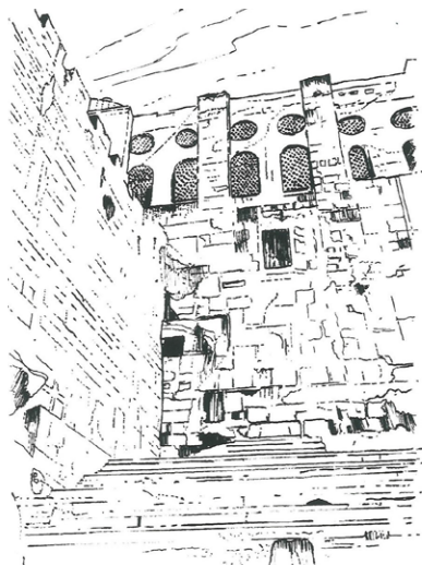
The Temple Mount, The second temple excavation site in Jerusalem. Illustrator: Maxwell Edgar.