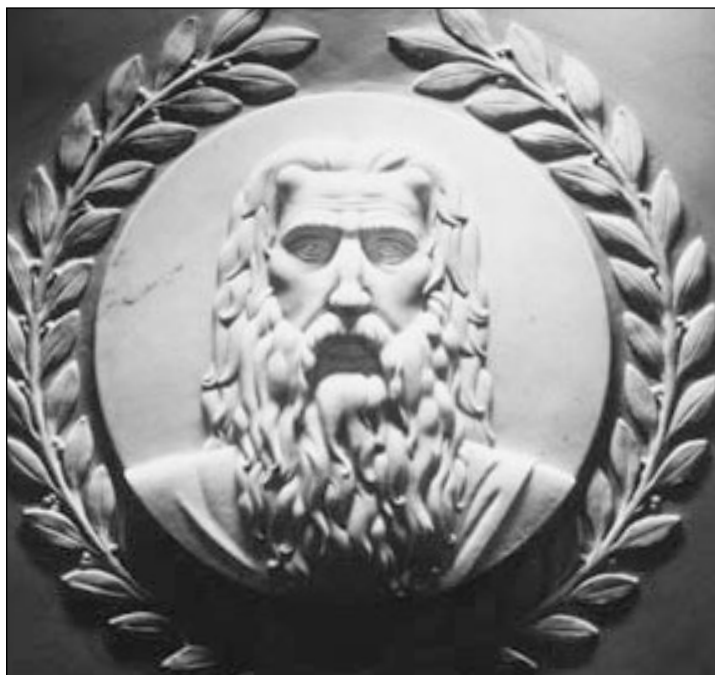
The marble bas-relief sculpture of Moses, to whom Jehovah gave the Ten Commandments on Mount Sinai, faces the Speaker's Chair, in the House of Representatives, Washington, D.C.

"And the Lord said, I am the LORD God of Abraham thy father: and the God of Isaac: the land whereon thou liest, to thee will I give it and to thy seed; And thy seed shall be as the dust of the earth, and thou shalt spread abroad to the west, and to the east, and to the north, and to the south: and in thee and in thy seed shall all the families of the earth be blessed." Genesis 28: 13-14.