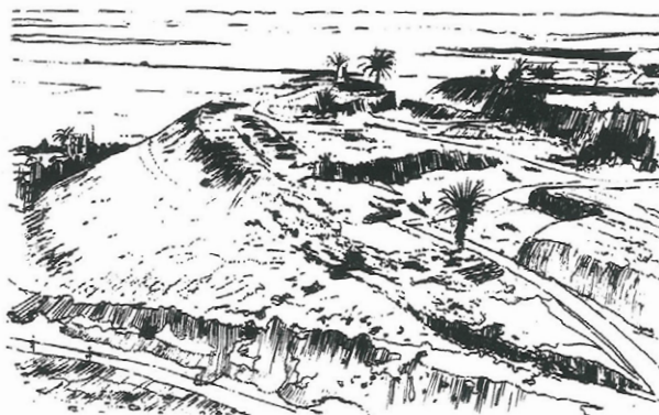
Har Megiddo, or Armageddon. Excavations of King Solomon’s Chariot City and Stables, with the Valley of Megiddo to the left.