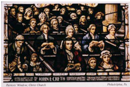
Christ Church Patriots 1790 Stained-glass window.

We then asked the Curator why the three Revolutionary War stained-glass windows in Christ Church, (including The Patriots' 1790 window – featuring Betsy Ross worshipping in her pew) had been removed in September, 1986. His answer was – “to return