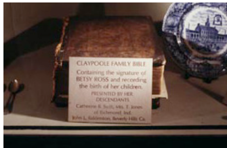
Betsy Ross' Family Bible displayed in her Front Parlor. (Removed to storage)

Three walls in the rear of the adjacent Betsy Ross bookstore displayed replicas of the famous great master painting of Betsy Ross seated in her front parlor, the first American flag with its 13 stars on her lap – the Committee from the Continental Congress comprising George Washington, Colonel George Ross and Robert Morris, requesting the seamstress to make the first flag. All four patriots were members of the congregation of Christ Church, called “the nation’s church,” being the founders’ place of worship – hence the most historic church in America. About 6 years ago, all these paintings disappeared. Upon enquiring from the new Curator of their whereabouts, I was