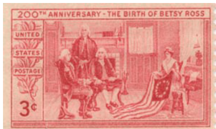
Betsy Ross 1952 Commemorative Stamp with Great Master painting of the four Christ Church patriots (painting removed from Betsy Ross Bookstore walls).

The above original records, both of Christ Church, Philadelphia and The Betsy Ross House, 239 Arch Street, Philadelphia, testify to Betsy Ross worshipping at Christ Church (pew no.12) and making the First American Flag. Both historic facts have been rewritten by revisionists who do not wish to teach America's